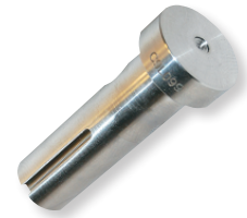
DIAMOND ORIFICE CARTRIDGE