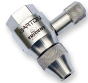
TRIDENT 2 CUTTING HEAD