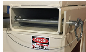
CONNECTING BOLTS & PINS

45"L x 45"W x 59"H Shipping wt. = 407 lbs. Part # WA00019