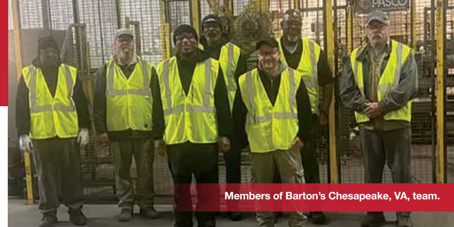
Members of Barton's Chesapeake, VA, team.

Barton employees extract, crush and process world-class garnet from the rock in our quarry and turn it into high-quality abrasive products.